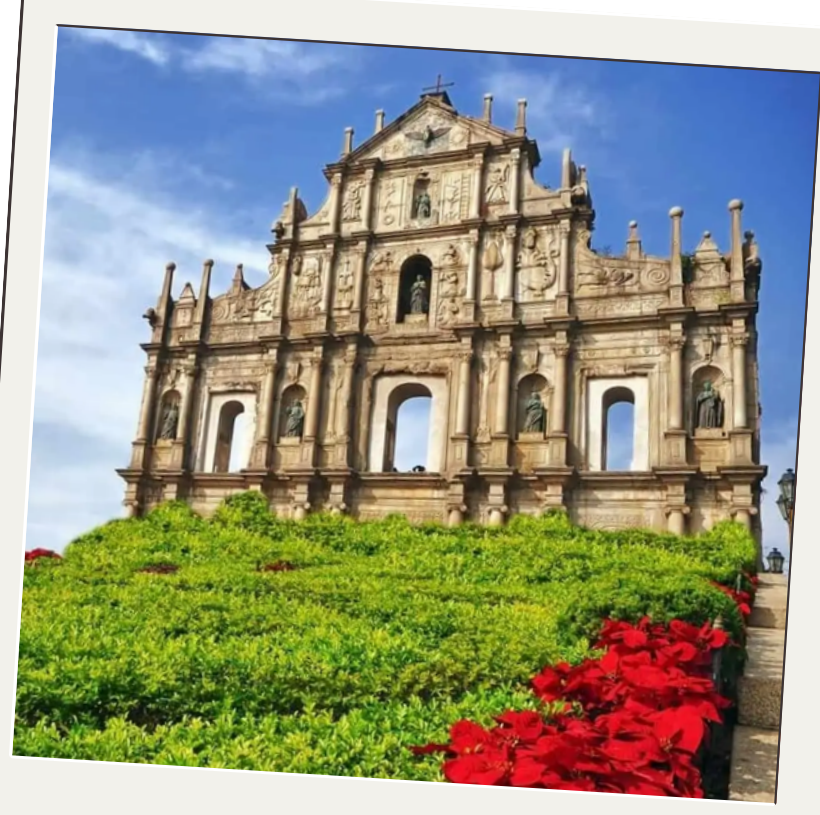
RUINS OF ST. PAUL'S