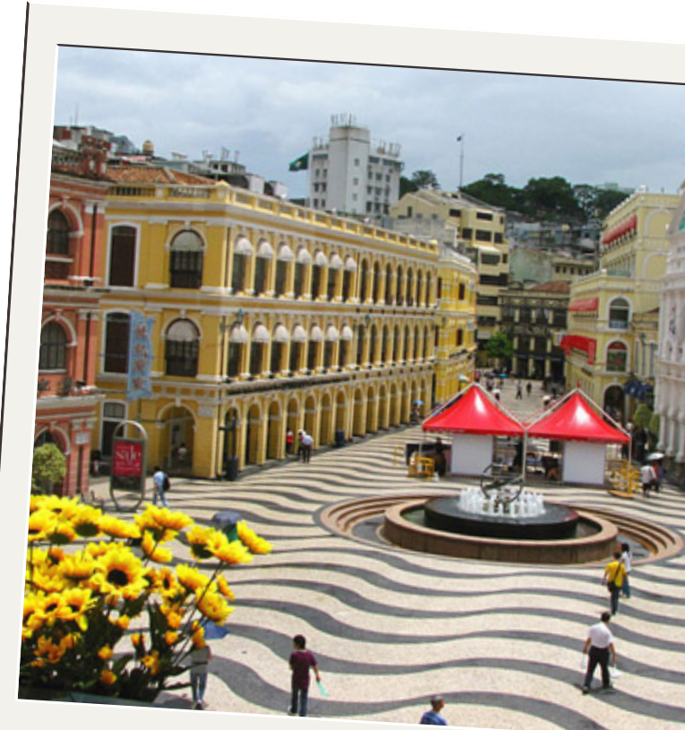
LEAL SENADO SQUARE & BUILDING